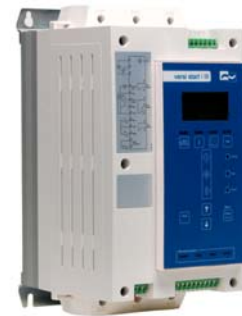
Soft Starters VS i III ...-23 ... 220